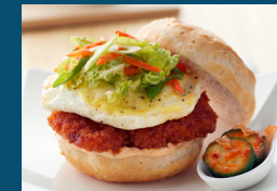
Fried Egg Korean Biscuit Sandwich