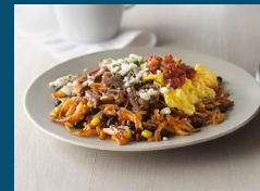
Cuban Breakfast Hash